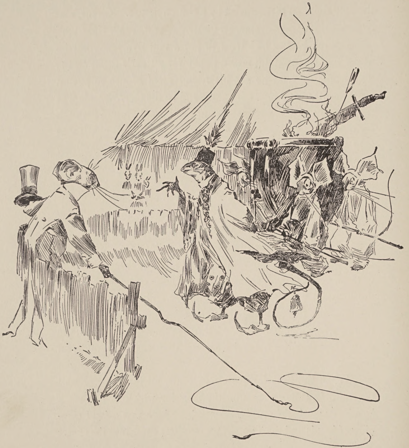
SALAMANDER SAYS HE EATS FIRE.